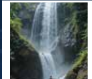
Air Terjun Sipiso Piso